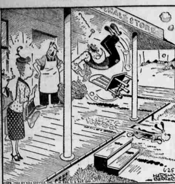
"That's the way his wife calls him to lunch!"

ALL METAL Teeter Toppers 10.50 Phone 5520 222 S. 7th POOLE'S BICYCLE STORE