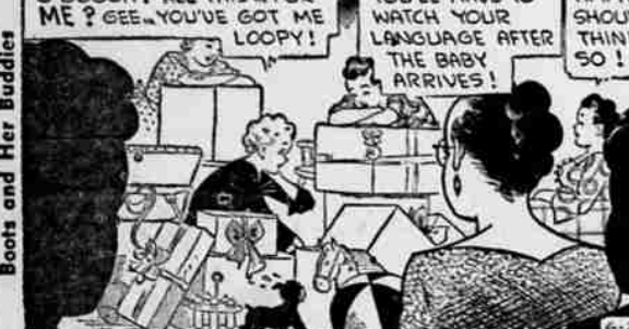
"Junior has a new horse, dear!"