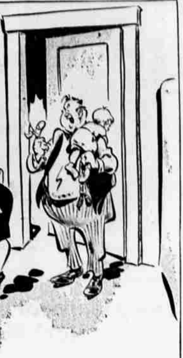
"Junior has a new horse, dear!"

LOST—Lady's black slipper billfold, Redwood Lodge Market, call Merrill Cleaners collect, Merrill, Ore. 6-28