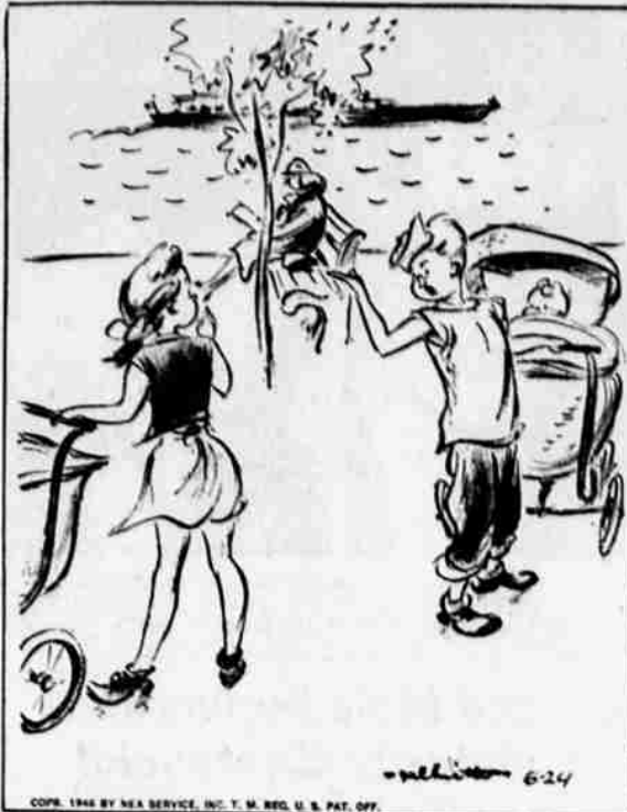
"Okay, Toots, same time tomorrow, huh?"