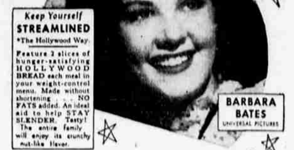
FIGURE allure begins with CONTOUR

Keep Yourself STREAMLINED *The Hollywood Way* Feature 2 slices of hunger-satisfying HOLLYWOOD BREAD each meal in your weight-control menu. Made without shortening... NO FATS added. An ideal aid to help STAY SLENDER. Tasty! The entire family will enjoy its crunchily nut-like flavor.