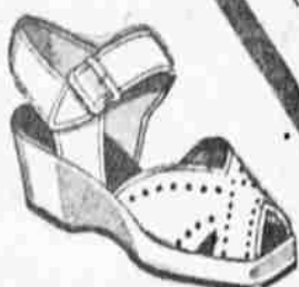
Broad strap sandal ... California made ... soft white Elkskin ...