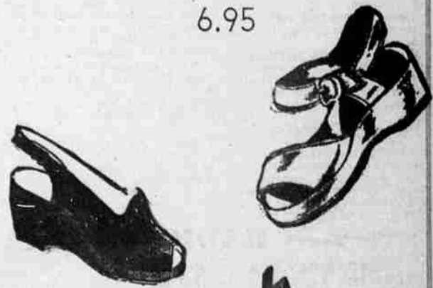
From Ferncraft ... Soft Indian Deer (light beige) or smooth white calf ...