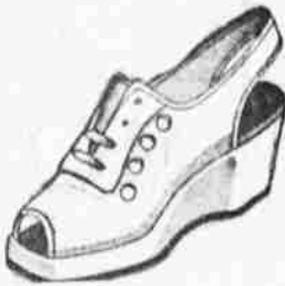
White Elkskin ... Sling back oxford designed by Pacific ...