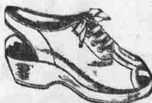
Rancho from Ferncraft ... In softest Elkskin ... Colors are White ... Red ... Beige ...