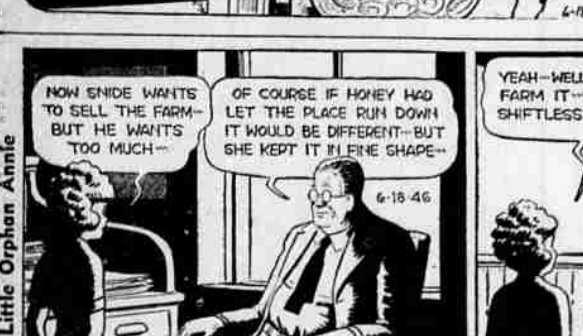
NOW SNIDE WANTS TO SELL THE FARM—BUT HE WANTS TOO MUCH—