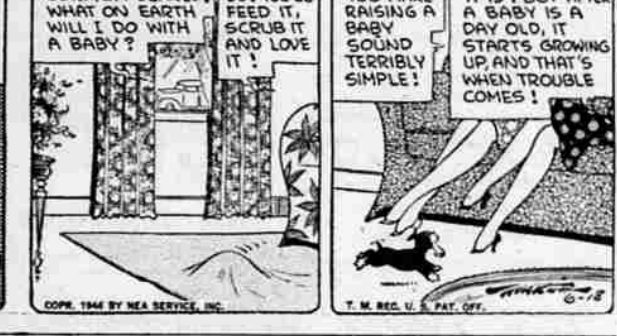
WELL, IT'S ALL HER IDEA! FORGET ABOUT MY LENDING HER TO YOU! WHAT LENDING IS DONE WILL BE WHEN SHE LENDS YOU YOUR BABY!