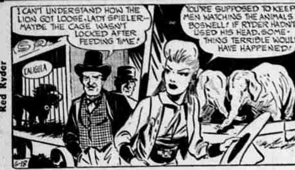
I CAN'T UNDERSTAND HOW THE LION GOT LOOSE. LADY SPEILER—MAYBE THE CAGE WASN'T LOCKED AFTER FEEDING TIME!