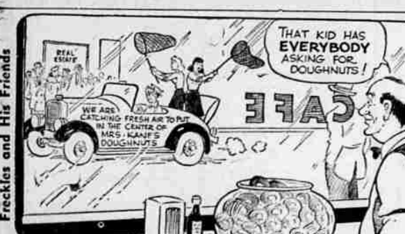
THAT KID HAS EVERYBODY ASKING FOR DOUGHNUTS!