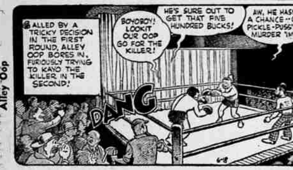
TRICKED BY A TRICKY DECEIT IN THE FIRST ROUND, ALLEY OOP BORES IN, FURIOUSLY TRYING TO KNOCK THE KILLER IN THE SECOND!