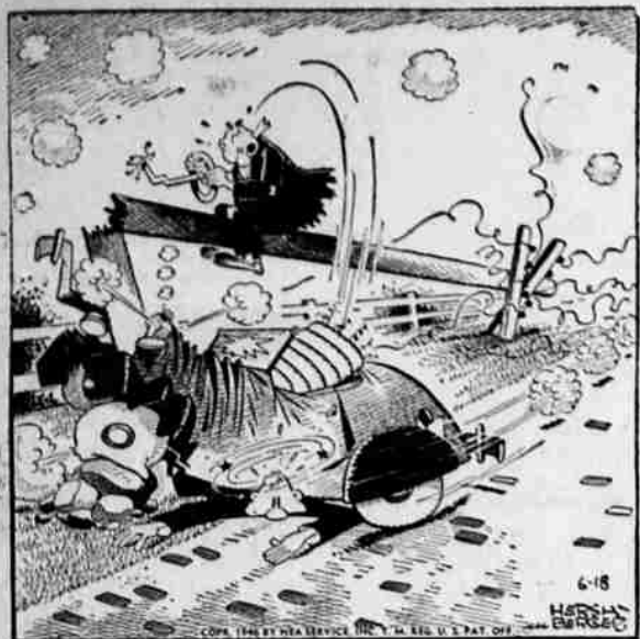
That's funny—I drank to your health and mine just a few minutes ago!