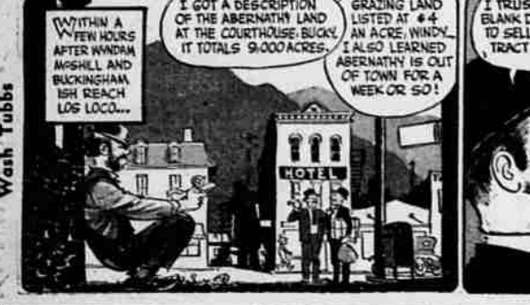
I GOT A DESCRIPTION OF THE COURTHOUSE LAND AT THE COURTHOUSE. LADY, IT TOTALS 9,000 ACRES.