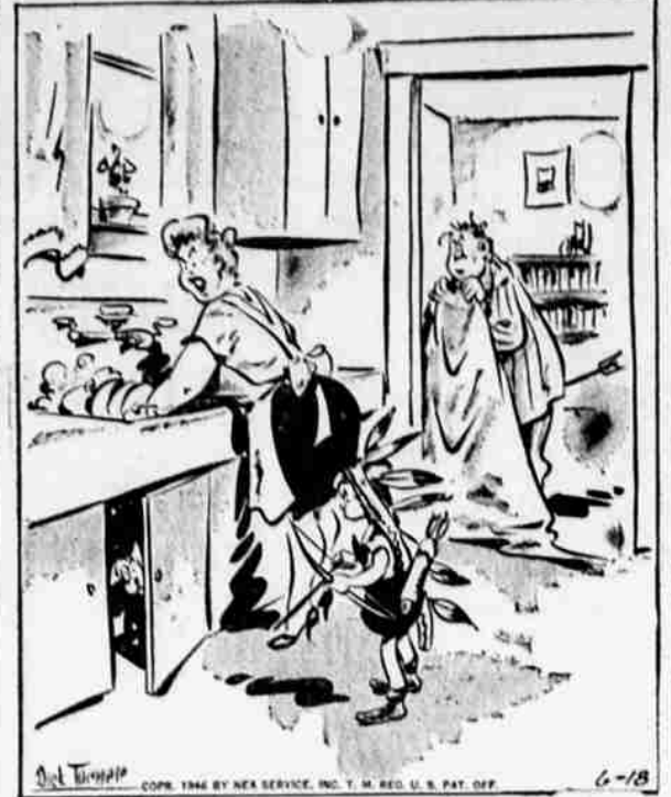
"Junior! Did you wake papa?"