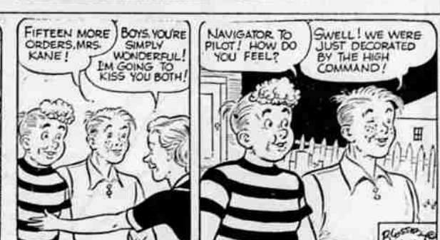
BOYS, YOU'RE SIMPLY WONDERFUL! I'M GOING TO KISS YOU BOTH!