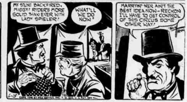
MY SNIFF BACKFIRED. I WISHED I RIDERS HADN'T SOUD "MAN EVER WITH LADY SPEILER."