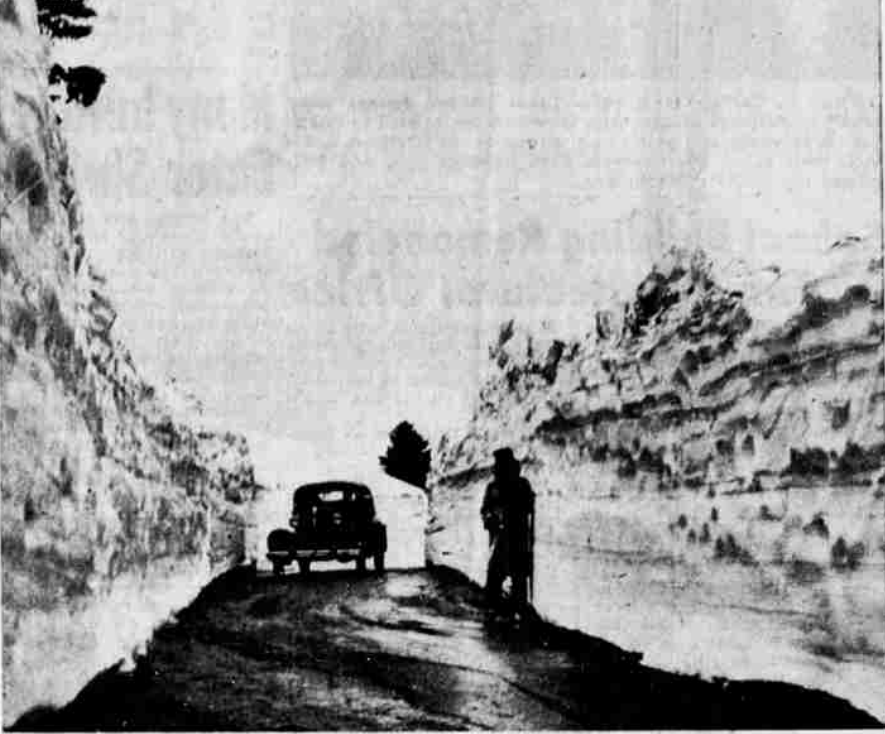
The upper picture shows high banks on Crater lake road near the rim area Sunday. Below, a view of the rear of the lodge. Many motorists went into the park over the weekend, when it was opened to travel for the season of 1946. If present plans materialize, the park will be kept open through forthcoming winters.