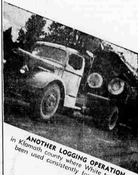
ANOTHER LOGGING OPERATION in Klamath county where White trucks have been used consistently for many years.