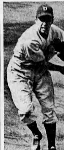
Pee Wee Reese, Brooklyn shortstop who never before hit higher than .272 for a major league season, is now pounding the pill for a .411 average to head both loops.