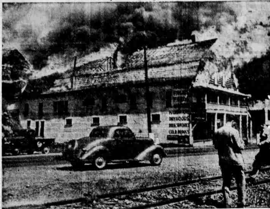
Firemen from four towns and state forestry department officials fought a losing fight to save the small Washington state village of Underwood from destruction by fire. All buildings in the village except a warehouse were destroyed and 30 families made homeless. The village was on the Columbia river and the fire was believed to have started from a spark.