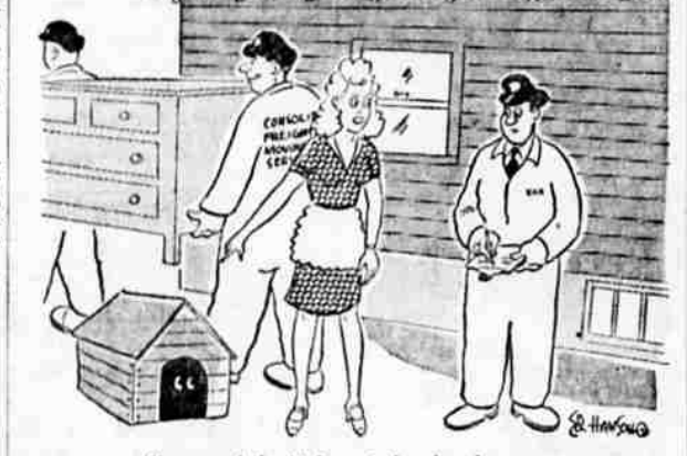
"... and don't forget the dog house—that's my husband in there!"