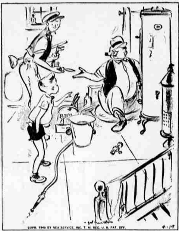
"Which one of you gets the most money—the one who keeps saying hand me this and hand me that, or the one who does the handing?"