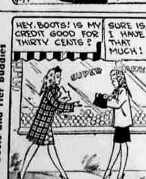
Boots and Her Buddies