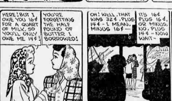
Boots and Her Buddies