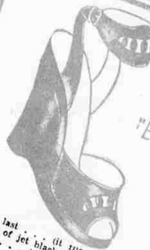
"Embracelet" by Iling