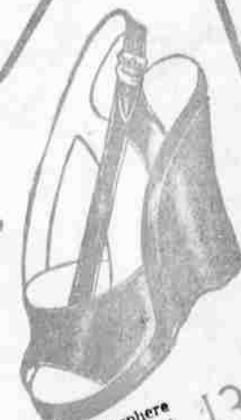
"Diane" by Iling