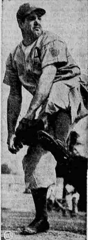
Still a picture of self-confidence, aging Bobo Newsom goes through first pitching workout with Philadelphia Athletics at West Palm Beach training camp.