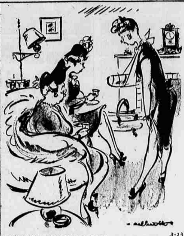
"Indeed I did get these mylons over the counter—and I've got a sprained wrist to prove it!"