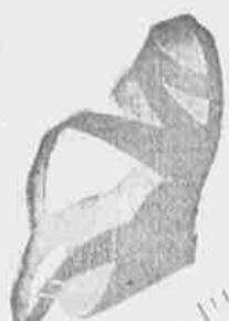
"Scandal" ... from Mercury ... of shining patent ... or tan calfskin. 7.95