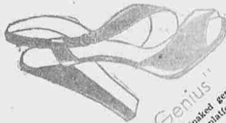
"Naked Genius" ... Ferncraft give you the "naked Gen-ius" ... Black Patent ... platform sole ... 10.95