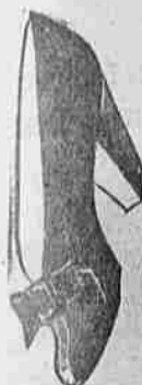
"Lassie" ... Johansen ... Black Gabardine ... closed heel ... open toe ... medium heel. 8.95