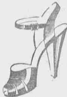
"Winnie" ... From Johansen ... of Forstmann Black Gabardine ... 8.95