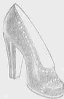
"Airdale" ... Brown calf Spectator ... hi-cuban heel. 7.95