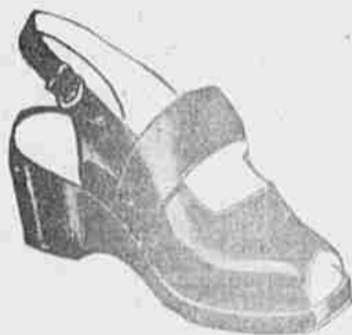
"Smash Hit" ... White crushed calf ... Full leather cushion platform. 6.95