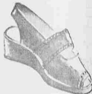
"Alert" ... From Joyce ... of course ... white calf—all leather platform sole. 6.50