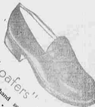
"Loafers" ... Genuine hand sewn "Norwegians" ... Antiqued leather. 5.95