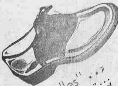
"Saddles" ... The "King of the Crop" ... of Yes ... "Saddles" ... of tan and white ... all sizes. 5.95