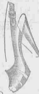
"Cutie" ... The sling back pump ... of Black Suede ... or Forstmann Wool Gabardine ... 8.95