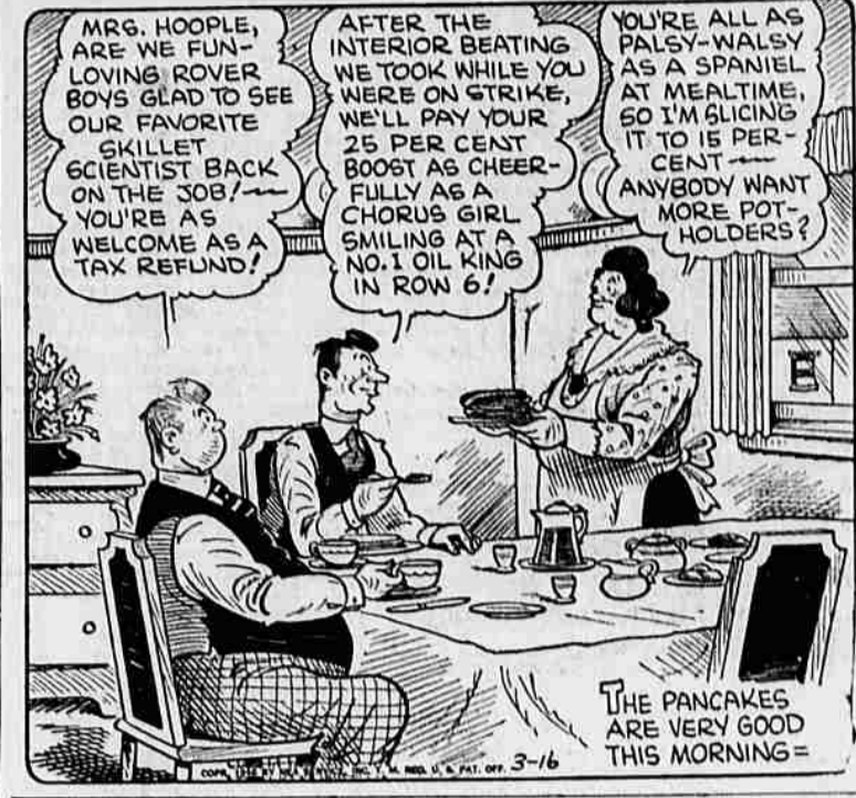
THE PANCAKES ARE VERY GOOD THIS MORNING=