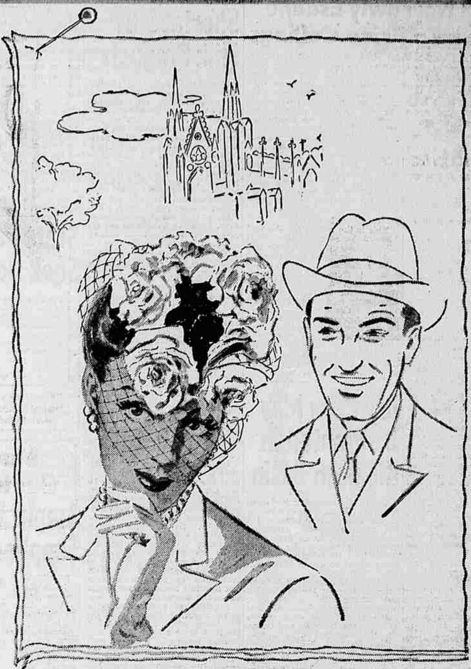
— AS ILLUSTRATED — Flower Trimmed Easter Hat By Beth Cabbage rose-trimmed forward turban in gray and shocking pink. Other pastel colors to choose from. Also other famous brands in flower trimmed modes. Priced 5.95 to 25.00