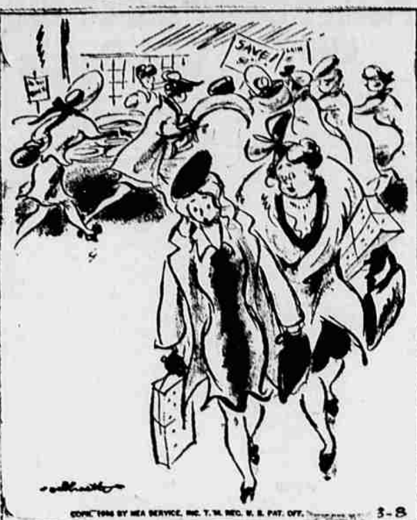
"I never miss one of these sales, and I often wonder what I've done with all the money they are supposed to save me!"