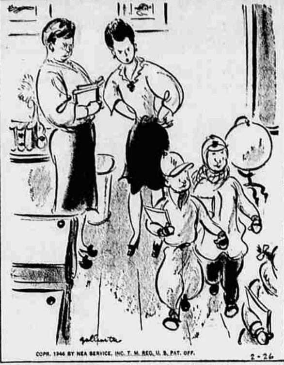
"Have you noticed an epidemic of spitballs since the end of the paper collection campaigns?"