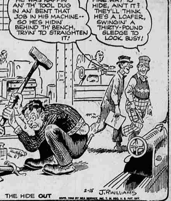
THE HIDE OUT