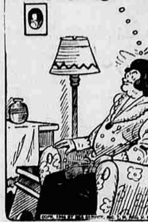
THE HIDE OUT