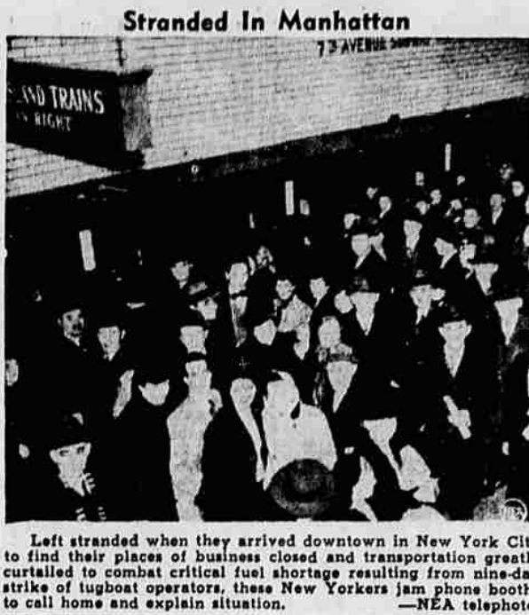
Left stranded when they arrived downtown in New York City to find their places of business closed and transportation greatly curtailed to combat critical fuel shortage resulting from nine-day strike of tugboat operators, these New Yorkers jam phone booths to call home and explain situation.