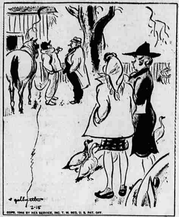
"Don't worry, we're not going to move—the first nice weather we get, your father always likes to price a few farms!"