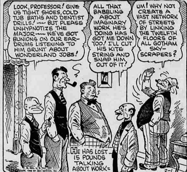
LOOK, PROFESSOR! GIVE US TIGHT SHOES, COLD TUB BATHS AND DENTIST DRILLS! — BUT PLEASE UNHYPNOTIZE THE MAJOR — WE'VE GOT BUNIONS ON OUR EARDRUMS LISTENING TO HIM GRUNT ABOUT WONDERLAND JOBS!

ALL THAT BABBLING ABOUT IMAGINARY WORK HE'S DOING HAS GOT ME DOWN TOO. I'LL CUT HIS KITE STRING AND SNAP HIM OUT OF IT!