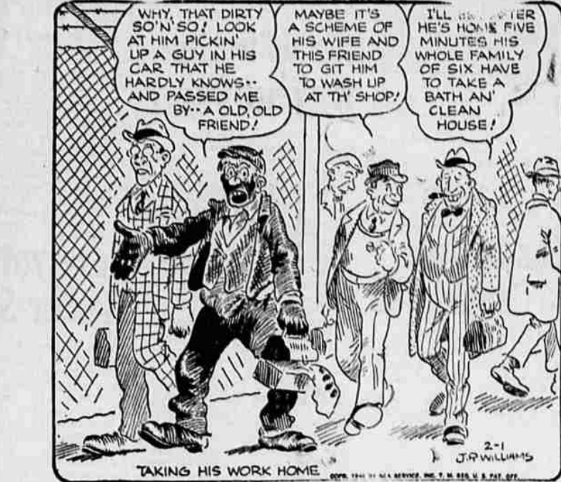
WHY, THAT DIRTY SO'N SO! LOOK AT HIM PICKIN' UP A GUY IN HIS CAR THAT HE HARDLY KNOWS—AND PASSED ME BY—A OLD, OLD FRIEND!

HE HAS LOST 15 POUNDS TALKING ABOUT WORK!