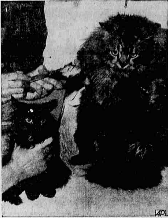
Alling with virus leukopenia, "Imp of Satan" (left) waits for his much-needed blood transfusion at Louisville, Ky., as the veterinarian takes blood from Imp's uncle, "Beautiful Bill." Imp's condition improved after the transfusion.