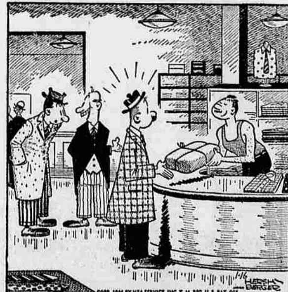
"Wonderful salesman! When he didn't have the right size he sold the shirt right off his back!"

STORM WARNINGS SEATTLE, Jan. 24 (AP)—Southwest storm warnings were ordered at 8 o'clock this morning for the Washington and Oregon coasts to Cape Blanco, with small craft warnings from there to Cape Mendocino. USE 666 Cold Preparations Liquid, Tablets, Salve, Nose Drops. Caution: Use only as directed.