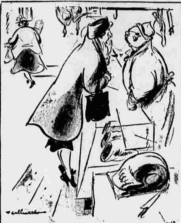
"Haven't you anything that is scarce and hard to get?"