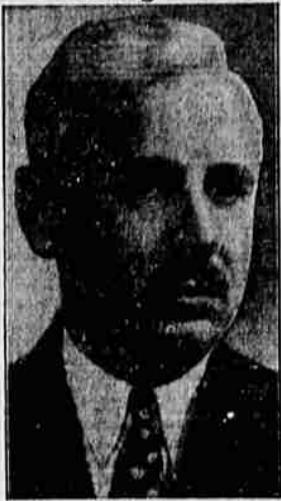
Dr. Will Durant, famous historian, will speak at the Knife and Fork club dinner here January 29.