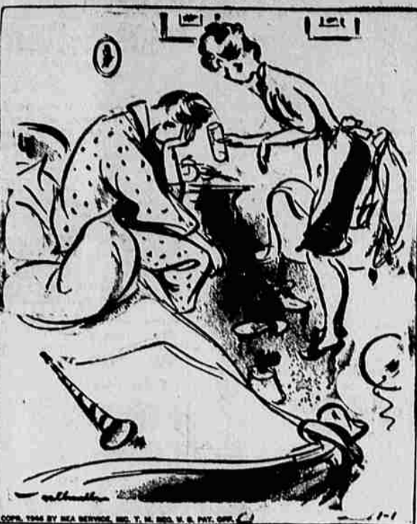
"If you've got a hangover, dear, why don't you go out and run around the block like you used to do in the army?"

The hair of one hare. The tail of another. One horse (with a secret ingredient of bear, Russian bear). Absolutely no caviar or champagne.