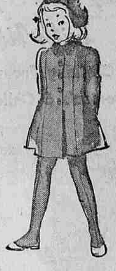
For snow babies — a warm color-bright snow suit! Water-repellent, sturdy. One of many 9.95