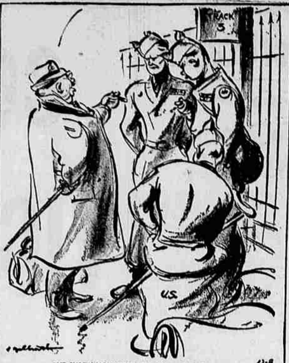
"We had a lot of pessimists in this country, but I was one who was sure you boys would win, even if it took 10 years!"