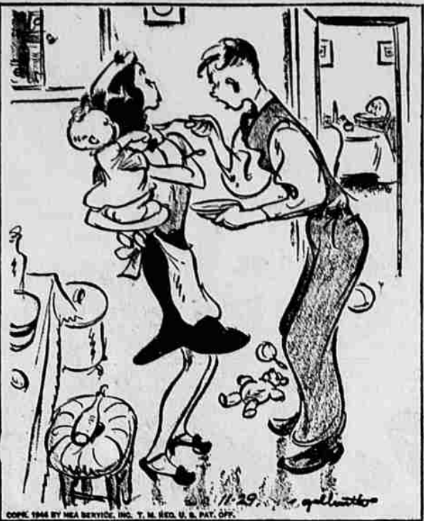
"I know how we can get him to eat what's good for him—let's put him on K-rations for a while!"