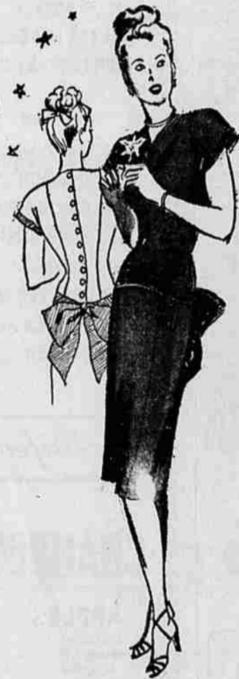
(Above) "BACK AND BLACK"

Beautifully simple in line, with a charming feminine touch of flat chrome nailheads on the collar and soft bow. Of Rayon Crepe... in Painter's Palette colors. 19.95