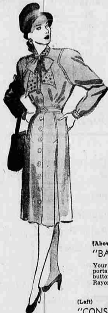
(Left) "CONSTANT COMPANION"

Beautifully simple in line, with a charming feminine touch of flat chrome nailheads on the collar and soft bow. Of Rayon Crepe... in Painter's Palette colors. 19.95