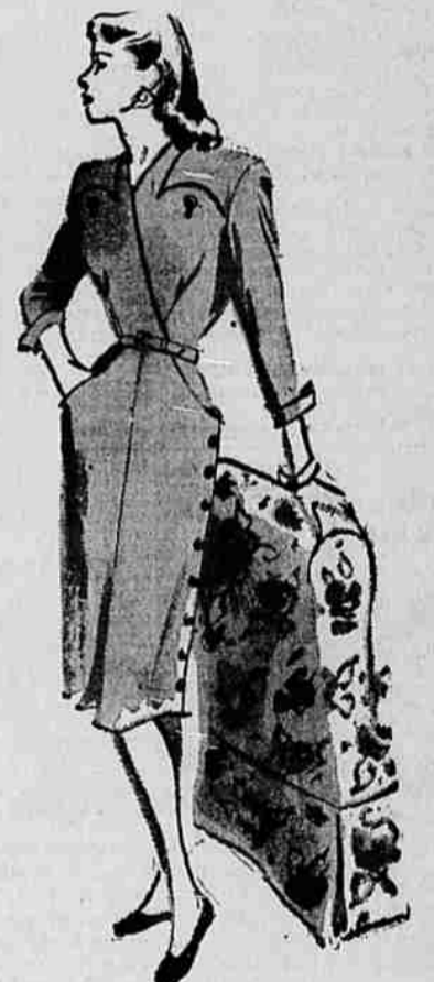
(Right) "GAB GIRL"

Your favorite Black Rayon Crepe dress for important occasions. A flatteringly smooth midriff, buttoned down the back to a smart Rayon Faille bowed bustle. 19.95