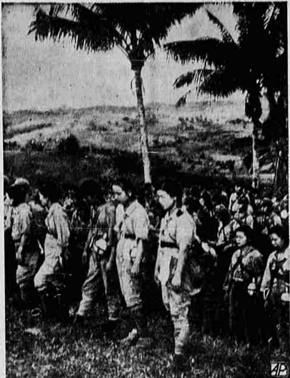
Army nurses who served 18 months with the Jap forces on Cebu, Philippines, line up during the ceremony marking the surrender of 10,000 Japanese troops to the U. S. Americal division nine days before Japan's official capitulation. This picture has just been released for publication.