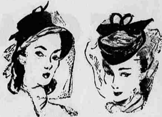
A Feather In Your Cap! Feather-Trim Felts