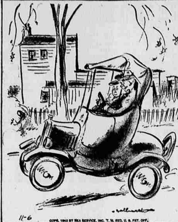
"I wouldn't mind buying one of the new cars if they could prove it was as tough as this old baby, but it would take 'em plenty of years to do that!"