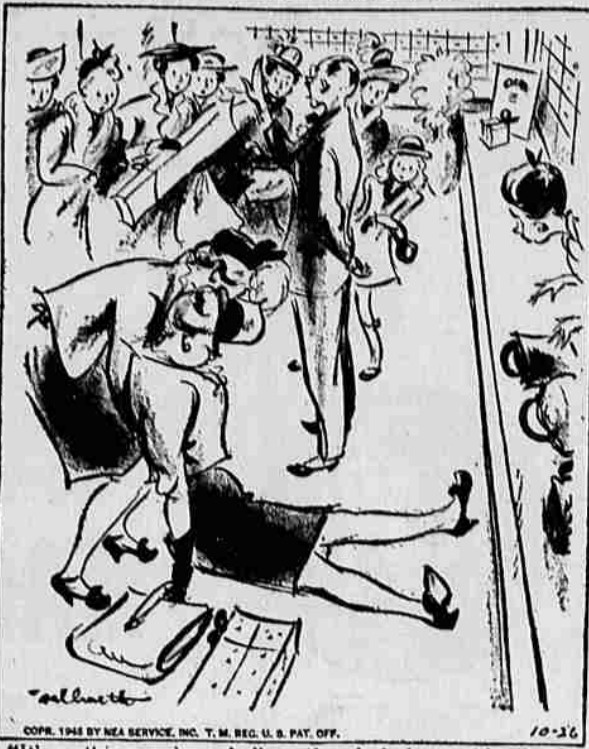
It's nothing serious, ladies—the clerk just said "Thank you!"