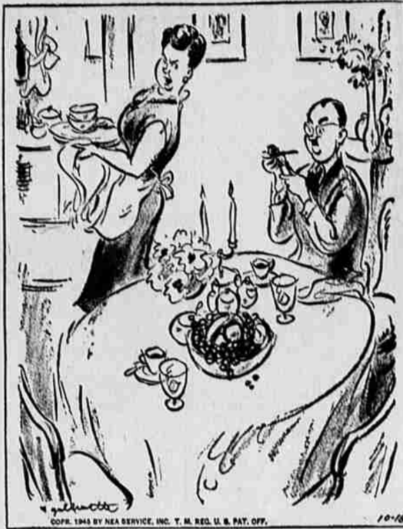
"You're always telling me what you said to the boss, but you never mention what he said to you!"