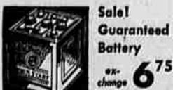
Sale! Guaranteed Battery 6.75 ex. charge 18-mo. guaranteed! Dependabul! 45 heavy-duty plates... 100 ampere-hour capacity!

USE YOUR CREDIT Ask about our convenient monthly terms. Any $10 purchase will open an account.