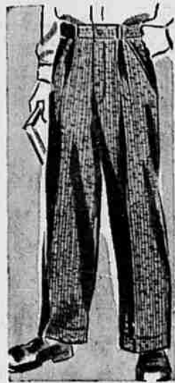
BOYS' STURDY LONGIES IN CORDUROY 3.00

Think how warm you'll be... in 100% virgin wool slip-on Long and boxy... so perfect for work, play or school wear. Winter-bright colors in sizes 34-40.