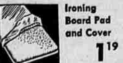
Ironing Board Pad and Cover 1.19 Extra thick, extra soft Cotton pad; Muslin, drawing cover! Both fit standard boards!