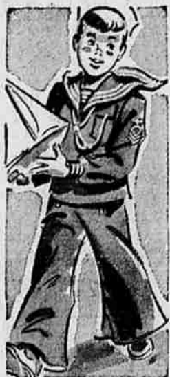
SNAPPY SAILOR SUIT FOR BOYS 4.47 (reg. price, 4.98)

He'll feel like a real tar in this salty sailor suit! Full cut for comfort. Sturdily tailored to weather hard knocks. Wool and cotton blend. 3-8.