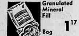
Granulated Mineral Fill 1.17 Bag Fireproof... and so easy to install because it pours! One bag covers 18 sq. ft. 3" deep.

Forms a weather-resistant film that won't fade! It's self-cleaning—rain washes away dirt!