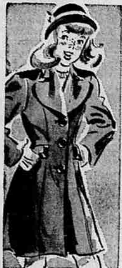
STURDY WARM COATS FOR THE YOUNGER SET 12.98

Pure wool coats at this price! Of course, at Wards! And we've a wonderful selection, too! Fitted coats, boy coats, wrap-arounds! A chesterfield with traditional velvet collar, new rounded lapels! The fabrics? Wool suedes, fleeces, monotonies... in all the good colors! You'll need that warm coat soon! Choose yours during Ward Week. Sizes 10-20.