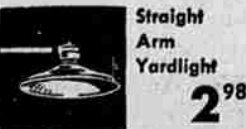
Straight Arm Yardlight 2.98 Light up dark yards! 23" galvanized bracket, 12" shade in green and white porcelain enamel finish.