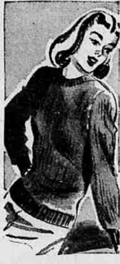
LOOK! 100% PURE WOOL CAROL BRENT SWEATERS 3.98

Chesterfields! Boy Coats! Fitted styles! And Wards are 100% pure wool knit fleeces, cotton-backed! New Fall shades, 7-14. Sizes 10 to 16 .....$14.98