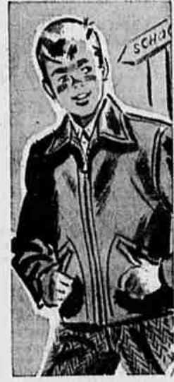
LOW-PRICED WARMTH FOR OUTDOOR BOYS 4.98

Sizes 10 to 18. When it comes to rough and tough wear, you can't beat corduroy. It can take all the knocks your boy can give it. Assorted colors.