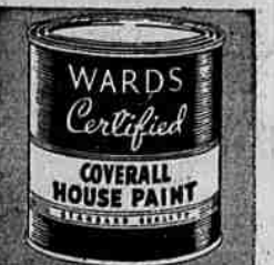
Best low cost paint we know of. Qts. ....71c

Forms a weather-resistant film that won't fade! It's self-cleaning—rain washes away dirt!