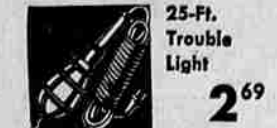
25-Ft. Trouble Light 2.69 Carry it into dark corners of the basement or attic. Has 25' cord, a heavy wire protector for bulb.