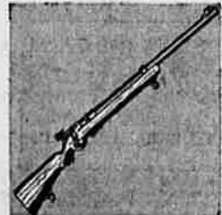
MOSSBERG US44 .22 CALIBER RIFLE 26.95 Made to War Dep't. specifications. Bolt action, 7-shot clip type.

He'll feel like a real tar in this salty sailor suit! Full cut for comfort. Sturdily tailored to weather hard knocks. Wool and cotton blend. 3-8.