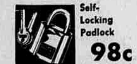
Self-Locking Padlock 98c Rustproof white metal padlock... fine for sheds, garages or barns.