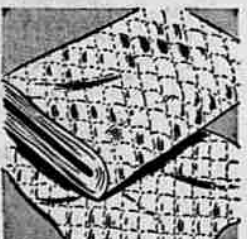
QUILTED TAFFETA IN 7 COLORS! 1.79

You can't buy better wall enamel! One coat covers; gives superior luster, washability, and hiding power! A gallon covers 600 sq. feet, one coat!