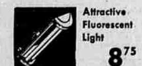
Attractive Fluorescent Light 8.75 Plugs right into regular kitchen light socket! No complicated wiring. 2 20-watt bulbs included.