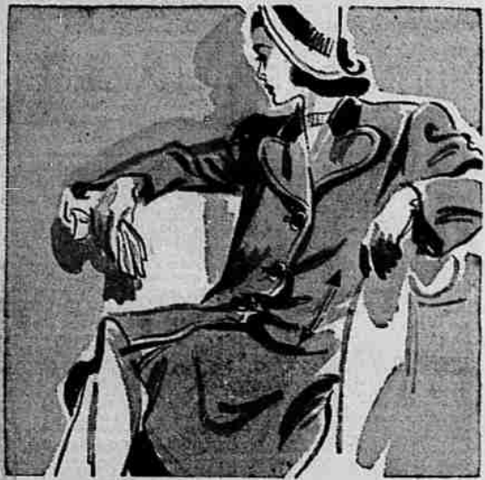
PURE WOOL COATS WONDERFUL VALUES AT 19.98

Pure wool coats at this price! Of course, at Wards! And we've a wonderful selection, too! Fitted coats, boy coats, wrap-arounds! A chesterfield with traditional velvet collar, new rounded lapels! The fabrics? Wool suedes, fleeces, monotonies... in all the good colors! You'll need that warm coat soon! Choose yours during Ward Week. Sizes 10-20.