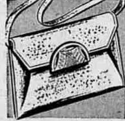
HANDBAGS FOR YOUNG GIRLS 98c plus 20% excise tax Priced to make your budget or allowance go far. Up-to-the-minute styles in smart colors.

Fine quality rayon taffeta on one side, fluffy cotton on the other. For quilts, robes, drapes. 24".