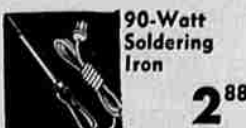
90-Watt Soldering Iron 2.88 Electric soldering iron... with 3/8" removable copper tip. Complete with 6-foot flexible cord.