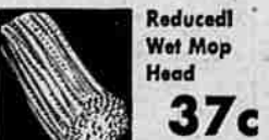
Reduced Wet Mop Head 37c Thick, absorbent, 4-ply cotton yarn, with well-sewed top. Save more by buying now at Wards!