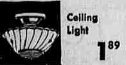
Ceiling Light 1.89 Gleaming mother-of-pearl colored bowl with graceful fluted edge... metal holder. Sale!