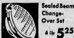
Sealed Beam Change-Over Set 5.25 For pre-'40 cars. Includes 2 bulbs, rims, wires, instructions! Makes night driving safer!