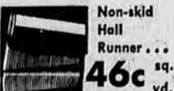
Non-skid Hall Runner... 46c sq. yd. Looks, wears like rubber! Grooved for extra safety. Moisture-resistant... washable! 36" wide.