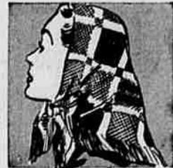
ALL PURPOSE WOOL SQUARES 98c A blazing assortment of wonderful plaids in soft, warm all-wool. Fringed edges. Full 27".