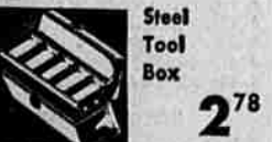
Steel Tool Box 2.78 Cantilever tray... rounded corners, rolled edges. Strong steel handle. Size 15x6 1/2 x 6 1/2 inches.

Tough 8-oz. sanforized denim for wear, plus the warmth of 25% re-used wool blanket lining!