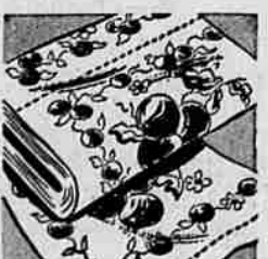
ABSORBENT PRINTED TOWELING two pieces 77c Save by hemming it yourself! Attractive patterns in strong cotton. Each piece, 17 1/2" x 37".