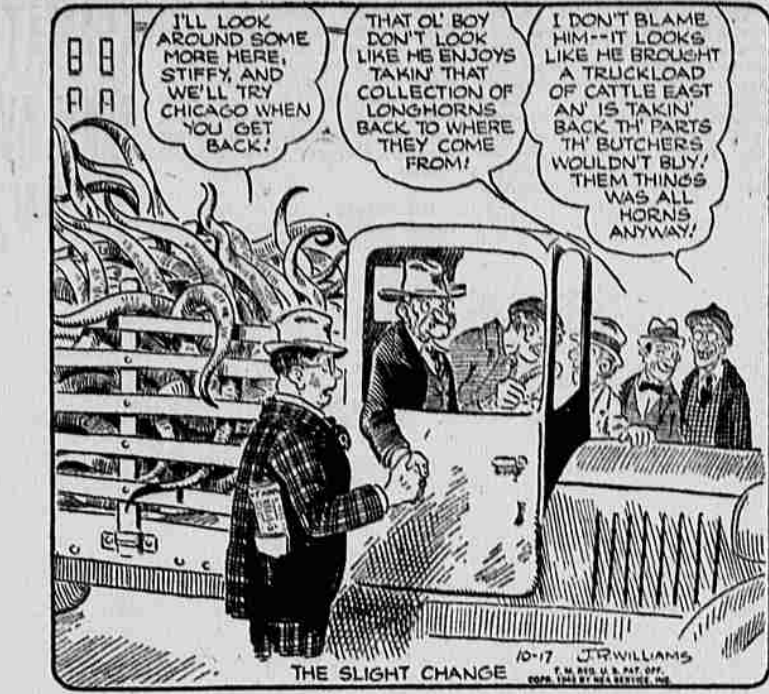
THE SLIGHT CHANGE

SIX—HERALD AND NEWS Wednesday, Oct. 17, 1943