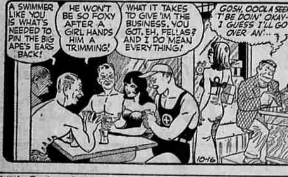
Alley Oop By Y. T. Hamlin