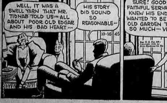
Little Orphan Annie By Harold Gray