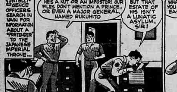
Wash Tubbs By Leslie Turner