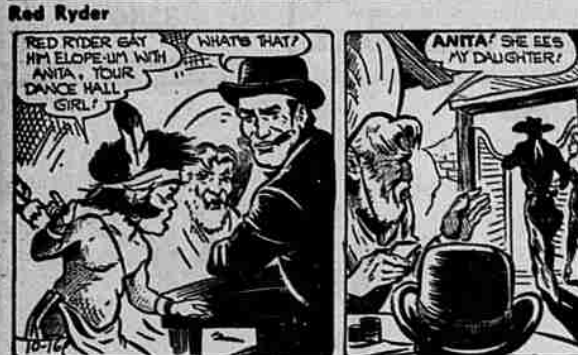
Red Ryder By Fred Harmon

One day per word 4c 2 day run per word 6c 3 day run per word 8c 4 day run per word 10c 5 day run per word 12c Weekly per word 15c Monthly per word 45c 20% Discount for Payment in Advance Discount for Payment by 10th Ads received by 1:00 p. m. will appear same afternoon in "New Today" column. NEW HEADLINES AND NEWS phone number, 8111. New Today LOST—Multi-fabric purse, containing birth certificate and other valuables. Finder take to Town Shop. 10-16 WANTED—Woman to care for small boy in my home 5 days a week. Some household work. Phone 5790. 10-16 A REAL BUY—4-bedroom brick house, in city limits. Ph. 4636. 10-20 FOR SALE—1941 GMC 194 inch wheel base, 16 ft rack, Timpek axle, 3 speed bearing. E. W. Cluff, Bonanza. 10-19 MOTOROLA car radio to trade for house radio. Good condition. Phone 3244. 10-18 HAVE THESE HARD-TO-GET 6.50x16 tires, also 6-ply, 60x16. Free assessment of tires. Edwards, Richmond, 6th and Klamath. 10-16 WANTED TO RENT by two adults, one or two-bedroom, comfortably furnished house, linen, silver, and cooking utensils not required. Write F. O. Box 657, 10-22