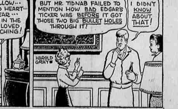
By Harold Gray