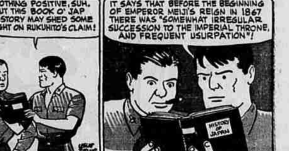
By Leslie Turner