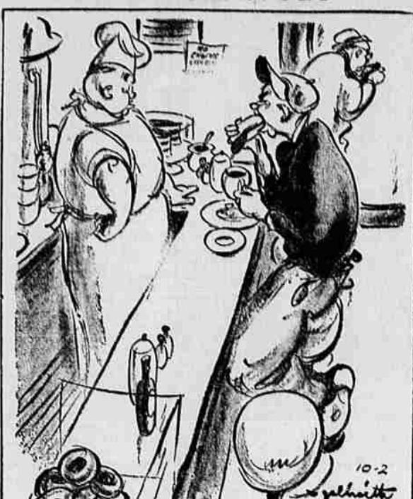
"I'm tired of this kitchen work—I'd get married in a minute if I could find a woman who could really cook better than I do!"

Market Quotations Closing quotations: American Can 107 1/2, Am Tel & Tel 152 1/2, Anaconda 26 1/2, Calif Packing & Sou 26 1/2, Commonwealth & Sou 14 1/2, Curtiss Wright 18 1/2, General Electric 48 1/2, General Motors 35 1/2, Gl. Nor Ry prfd 55 1/2, Int. Harvester 92, Kenilworth 28 1/2, Long-Bell "A" 23 1/2, Montgomery Ward 68 1/2, Northern Pacific 28 1/2, N Y Central 28 1/2, Pac Gas & El 28 1/2, J C Penney 129, Safeway Stores 143 1/2, Sears Roebuck 32, Southern Pacific 28 1/2, Standard Brands 15 1/2, Sunshine Mining 15 1/2, Union Oil Calif 150 1/2, U S Steel 75 1/2, Warner Pictures 19 1/2