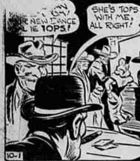
THE NEW DANCE IS SHE'S TOPS WITH ME, ALL RIGHT!