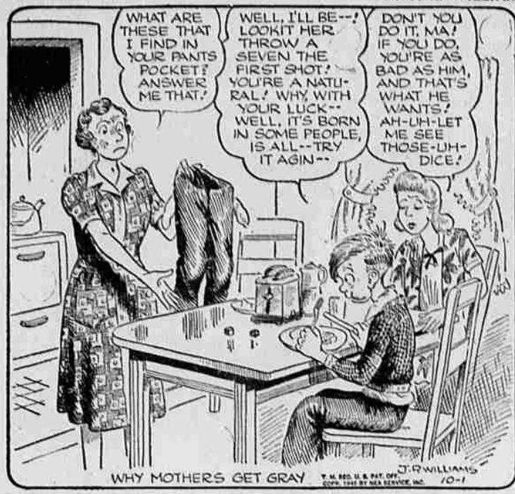
WHAT ARE THESE THAT I FIND IN YOUR PANTS POCKET? ANSWER ME THAT!