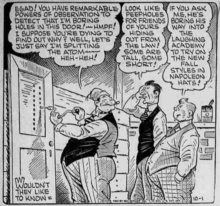
EGAD! YOU HAVE REMARKABLE POWERS OF OBSERVATION TO DETECT THAT I'M BORING HOLES IN THIS DOOR! ...