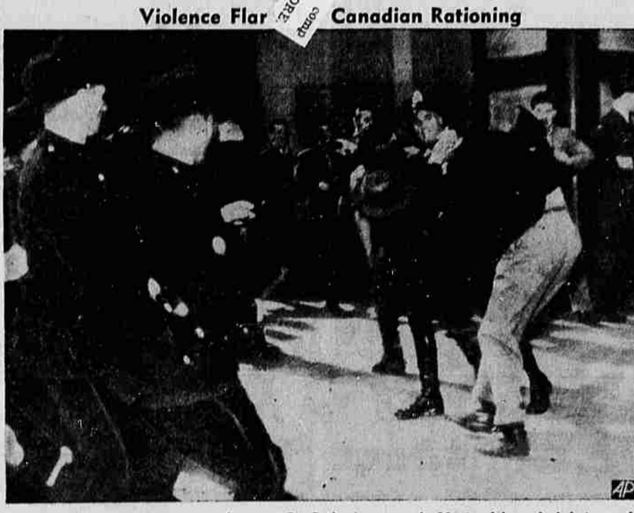
A policeman (center) clubs a rioter on St. Catherine street in Montreal in a clash between law enforcement officers and roving gangs protesting the nation's 16-day-old meat rationing program. (AP Wirephoto).

Bodies Cremated "The workers begin removing bodies—still warm covered with blood, human excrements. Then the bodies must go to the (Continued on Page Three)