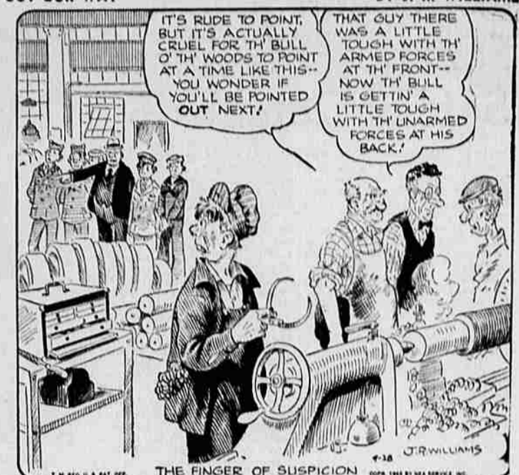
IT'S RUDE TO POINT, BUT IT'S ACTUALLY CRUEL FOR TH' BULL O' TH' WOODS TO POINT AT A TIME LIKE THIS—YOU WONDER IF YOU'LL BE POINTED OUT NEXT? THAT GUY THERE WAS A LITTLE TOUGH WITH TH' ARMED FORCES AT TH' FRONT—NOW TH' BULL IS GETTIN' A LITTLE TOUGH WITH TH' UNARMED FORCES AT HIS BACK! THE FINGER OF SUSPICION 9-28