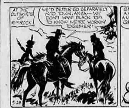
WE'D BETTER GO SEPARATELY—I'D DON'T WANT BLACK TOM TO KNOW WE'RE WORKING TOGETHER! WELL, I CAN TELL YOU, YOUR HEAD WOULD MAKE A BETTER BOWLING BALL!—LEAVE THAT DOOR ALONE BEFORE I SLAM YOU WITH IT! SHE MAY BE SHUTTING THE DOOR ON A GREAT INVENTION! 9-28