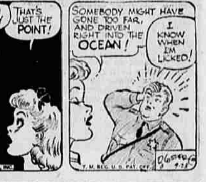
HERE SHE IS, CHIEF! SHE SAYS SHE'S BEING INITIATED! WHY DID YOU PUT THAT 'DEAD-END STREET' SIGN ON THE NATIONAL HIGHWAY? WE DIDN'T WANT PEOPLE TO DRIVE PAST THE DEAD-END AND HAVE AN ACCIDENT! ACCIDENT?—ARE YOU CRAZY? THAT HIGHWAY RUNS FROM THE ATLANTIC TO THE PACIFIC! THAT'S JUST THE POINT! SOMEBODY MIGHT HAVE GONE TOO FAR, AND DRIVEN RIGHT INTO THE OCEAN! I KNOW WHEN I'M LUCKY! 9-28