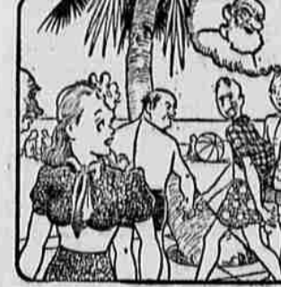
WHAT'S THE BIG IDEA? YOU'LL NEVER GET PEOPLE TO STAY HERE UNLESS YOU MAKE THE PLACE ATTRACTIVE!