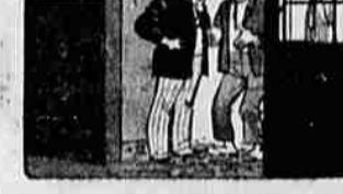
WHAT OF DESTRUCTIVE FORCE OF TERRIBLE AMERICAN ATOMIC BOMB, NIKKI?

AS ALLIED TROOPS OCCUPY THE JAP CITY OF OYOYA, A FEW NATIVES REFUSE TO BELIEVE JAPAN IS DEFEATED.