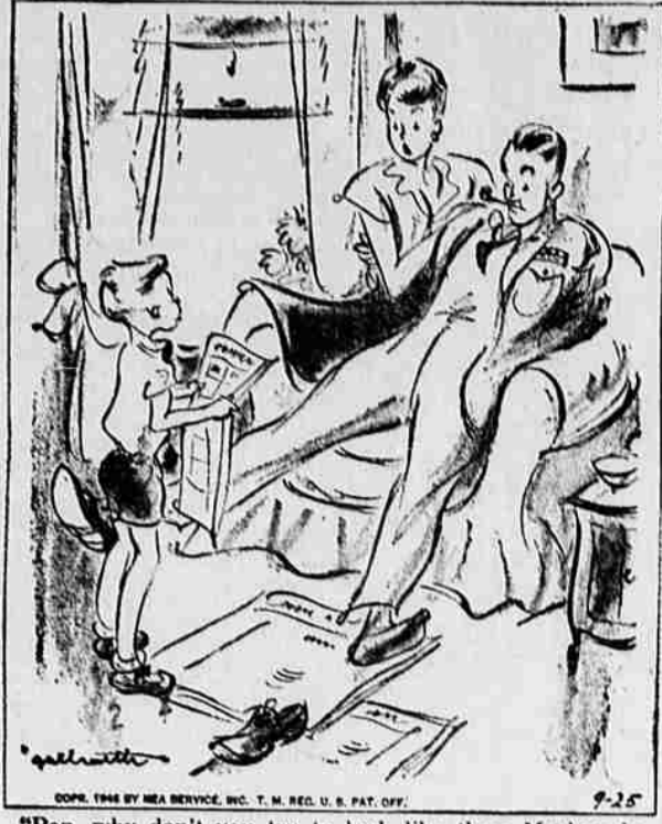
"Pop, why don't you try to look like these Marines in the comic strips?"