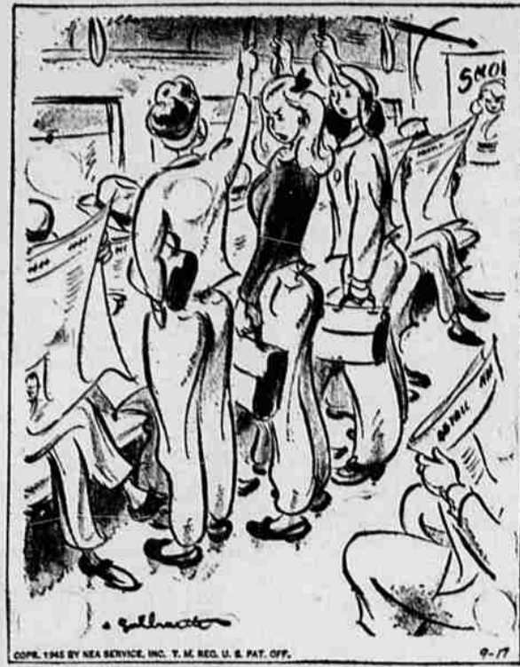
"You'd think some of these men would be tired of sitting down after lolling all day in offices!"

Two Australians once were beaten with shovels and pick handles until their arms were broken, simply because they failed to understand the Japanese orders, Scott related.