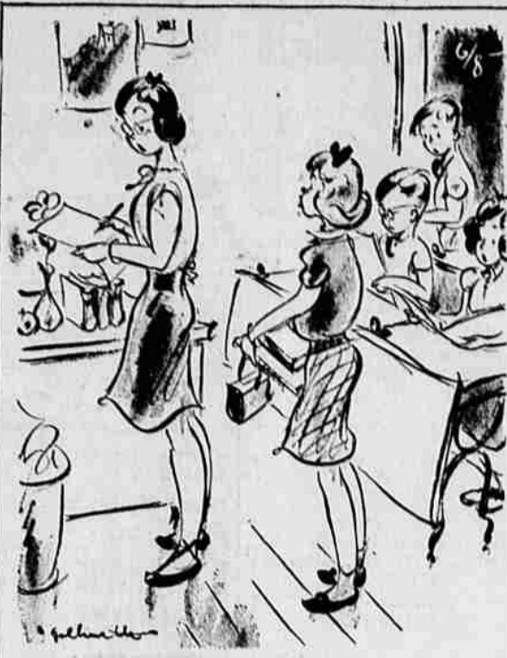
"I hope you give me better grades in English this year—I spent the summer reading ever so many comic books!"