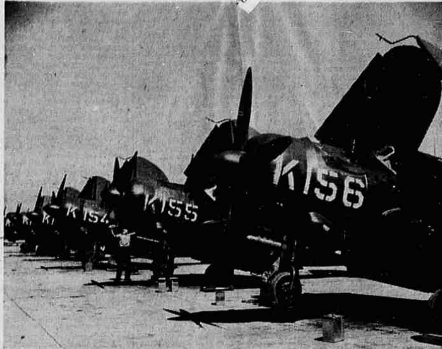
Helldivers, or SB2Cs, are shown parked along the large concrete apron at the Klamath naval air station. Representatives of the press were allowed to look over the station last week which was the 32nd anniversary of naval aviation. For other air station pictures, see page 3.